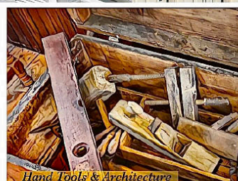
Hand Tools & Architecture