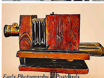
Early Photography & Postcards