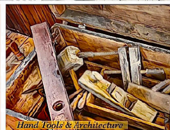
Hand Tools & Architecture